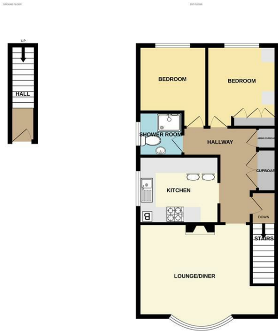
16 SHERWOOD COURT, CHILWELL

Whilst every attempt has been made to ensure the accuracy of the floorplan contained herein, measurements of plans, windows, rooms and any other items are approximate and no responsibility is taken for any error, omission or mis-statement. This plan is for illustrative purposes only and should be used as such by any prospective purchaser. The services, fixtures and appliances shown have not been tested and no guarantee is given for their condition or efficiency at the time of writing.